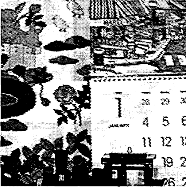
Figure 2. Part of the scene Mobile and Calendar.